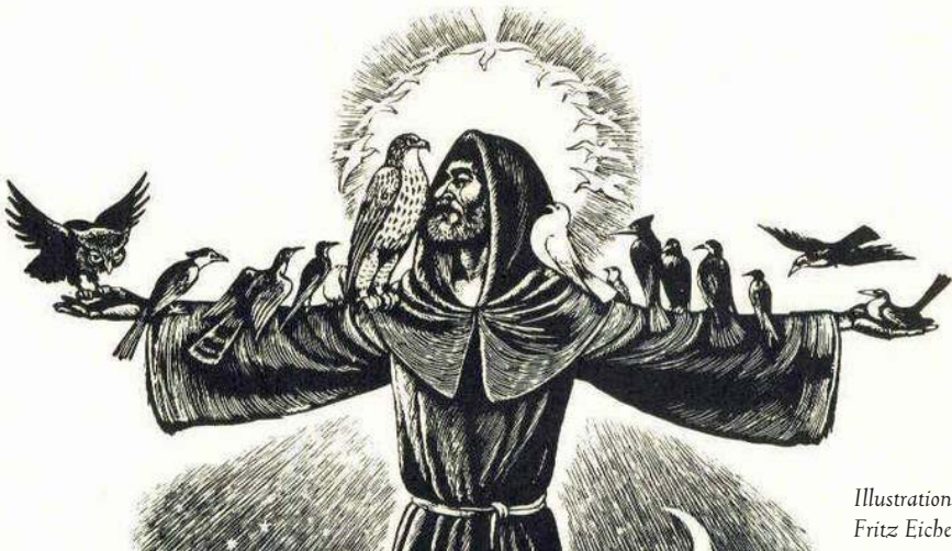
Illustration by Fritz Eichenberg