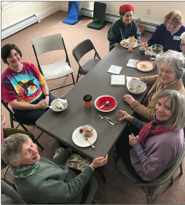
Friends enjoy warm sistership during the Heifer International Fundraising potluck held at Havurah on March 26.